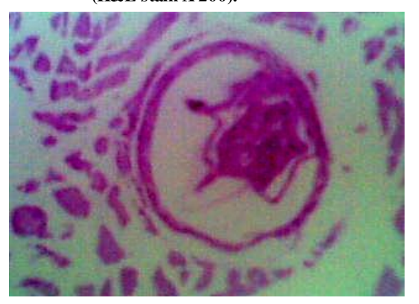
Figure 6: Encysted metacercarae surrounded by slight edema and fibrosis of musculature.