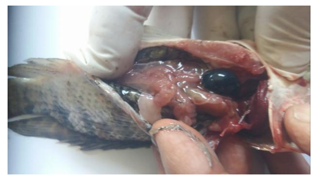
Figure 3: Distended gall bladder due to hepatitis.