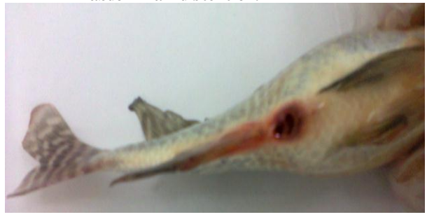
Figure 2: Fish suffering inflammation of the vent.